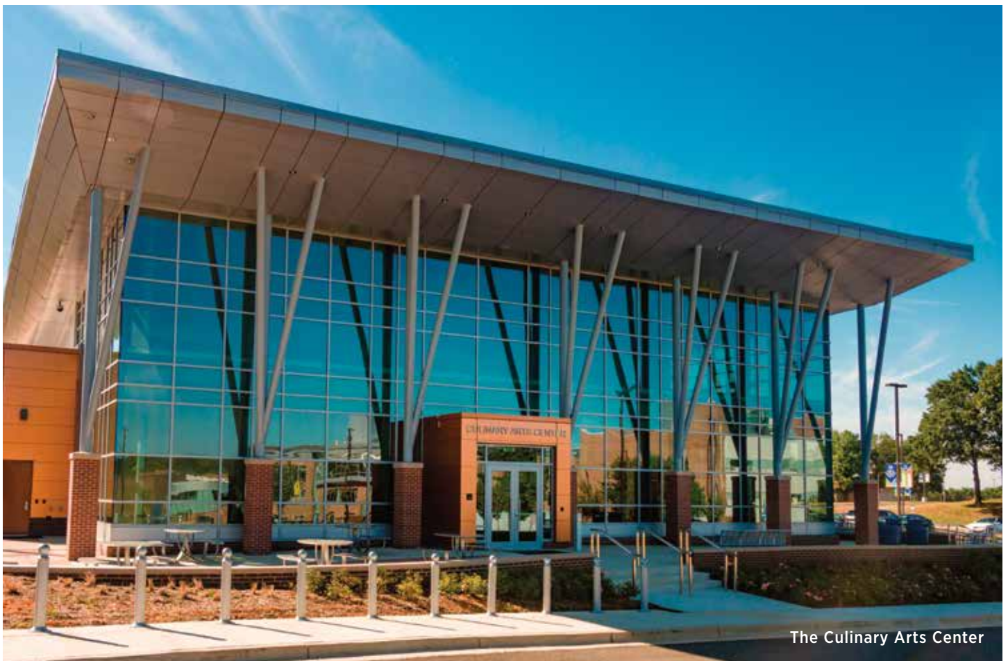
The Culinary Arts Center

Prince George's Community College will continue its mission to "provide affordable, high-quality learning experiences that support personal, professional, and educational development for diverse populations contributing to the economic equity and cultural vibrancy of our community." Construction, programming, and educational offerings are all focused on student success, regional impact, and