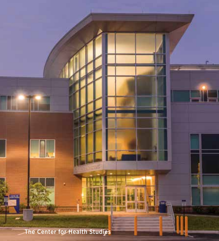
The Center for Health Studies

The Center for Health Studies , completed in 2012, replaced 10 temporary buildings. It was the first capital improvement project where the design funding was split over two years.