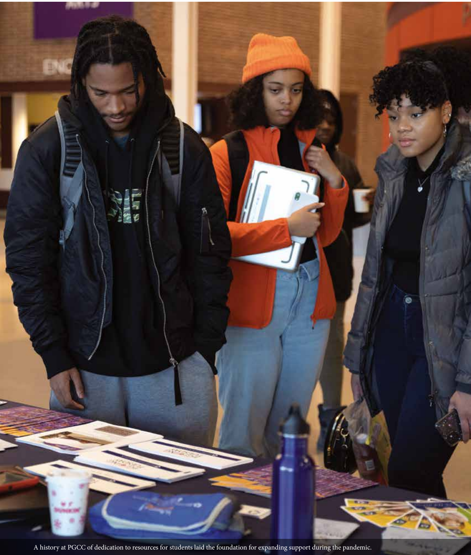
A history at PGCC of dedication to resources for students laid the foundation for expanding support during the pandemic.