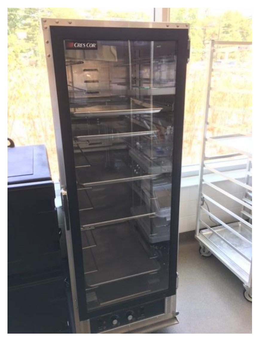
Qty 2 / Transportable, not stationary