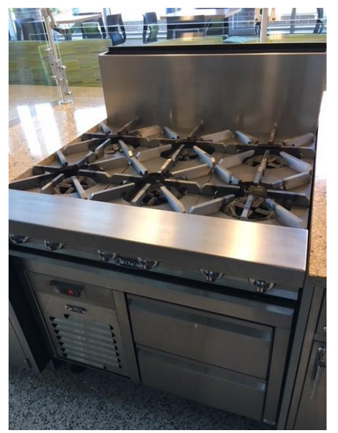
Demo Kitchen Range