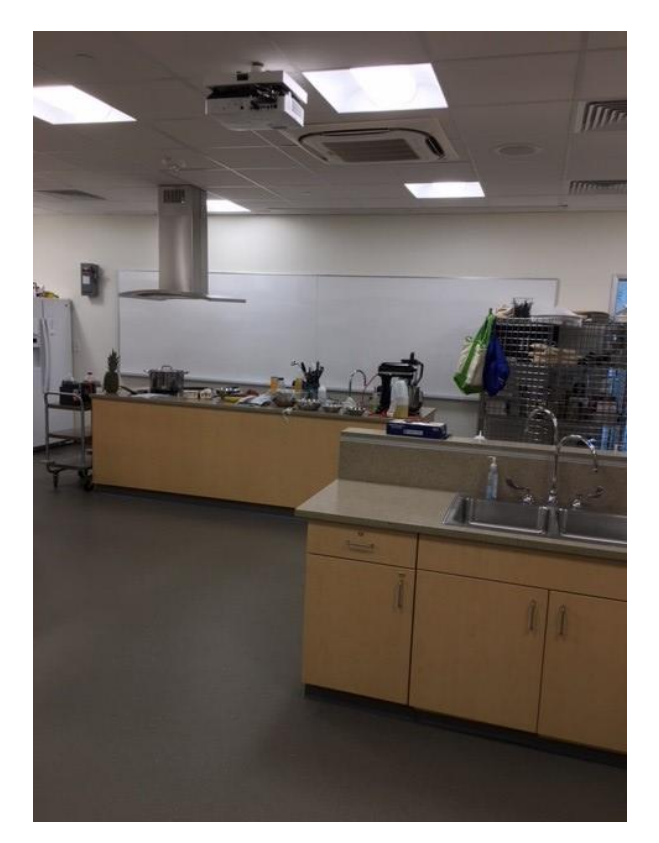
Home Style Workstations – Once/Year Cleaning