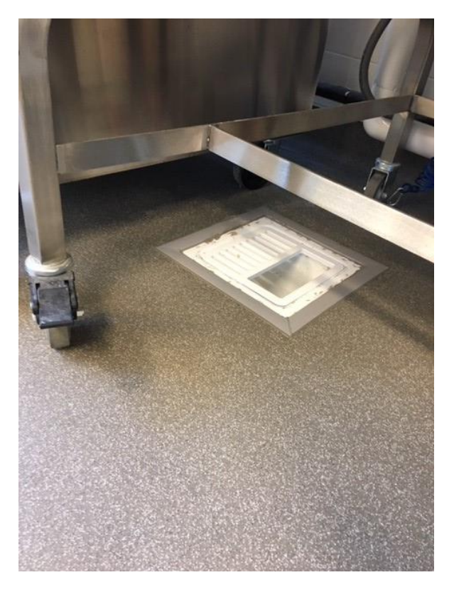
Large Drain Example