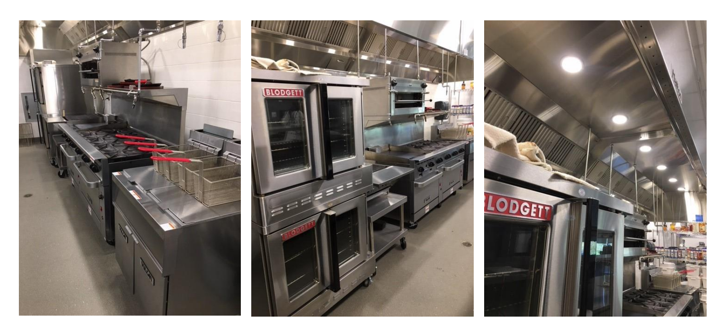
Hot Line /Ala Carte Line