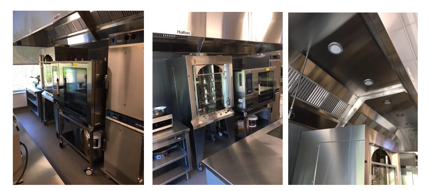
Back Wall Equip