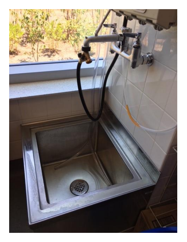
SanRoom Water Access