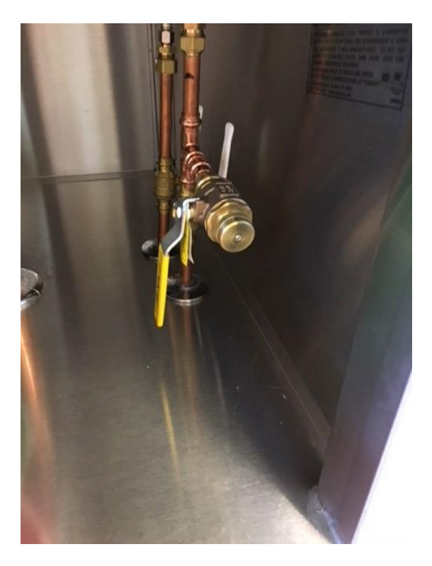
Kitchen Water access/adpator